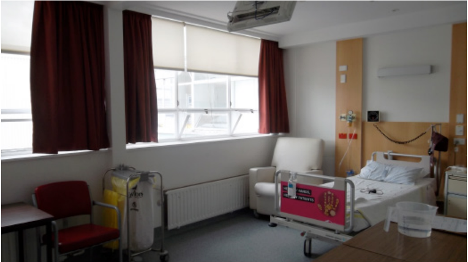
Room 25, Ward M5, Level 5 Menzies Building at Waikato Hospital

It will be necessary for you to be isolated during your admission as you will be receiving a radioactive substance which could be a health hazard to others. The room is designed to ensure as little radiation as possible is passed on to the other people nearby. During your stay you will be required to remain in your room with the door closed, by yourself, for one week.